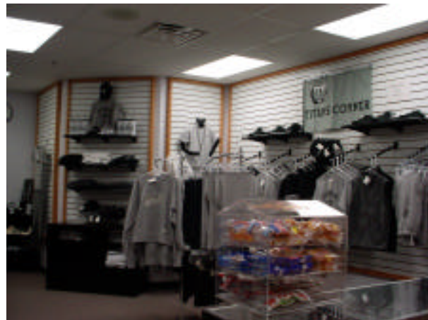
Some of Titans Corner's most popular items